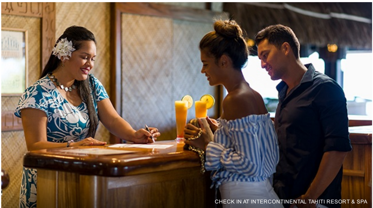
CHECK IN AT INTERCONTINENTAL TAHITI RESORT & SPA

Overnight stay in Tahiti at InterContinental Tahiti Resort & Spa in a Classic Garden View Room.