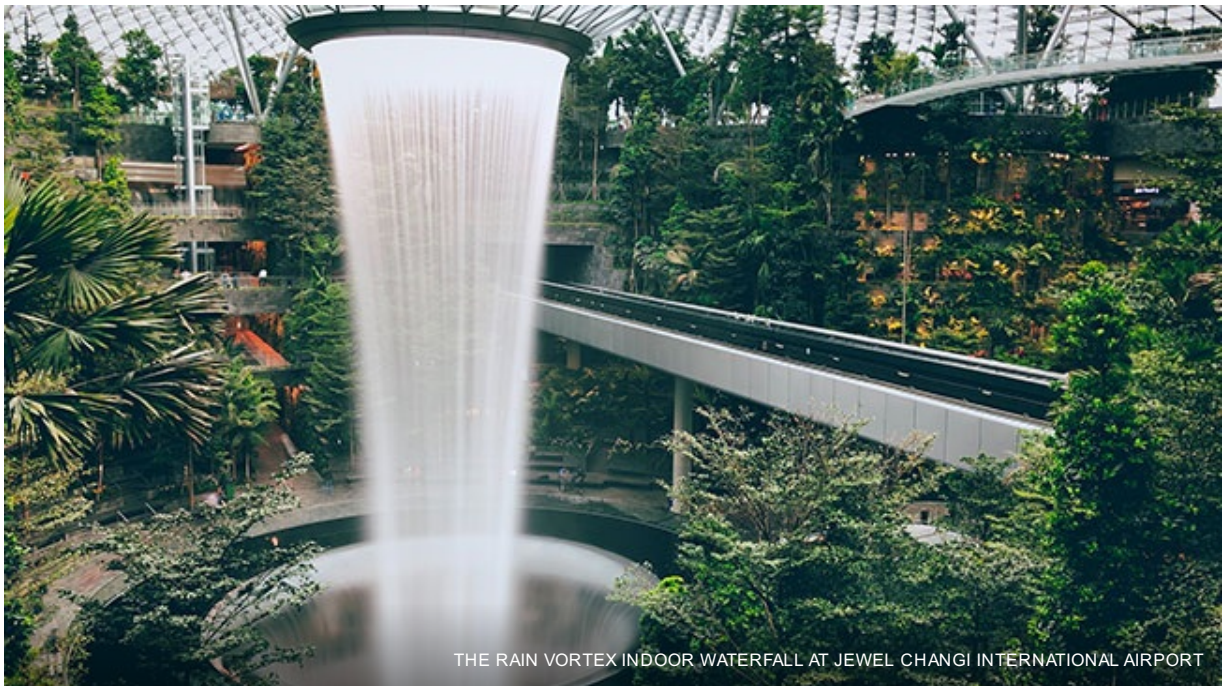
THE RAIN VORTEX INDOOR WATERFALL AT JEWEL CHANGI INTERNATIONAL AIRPORT