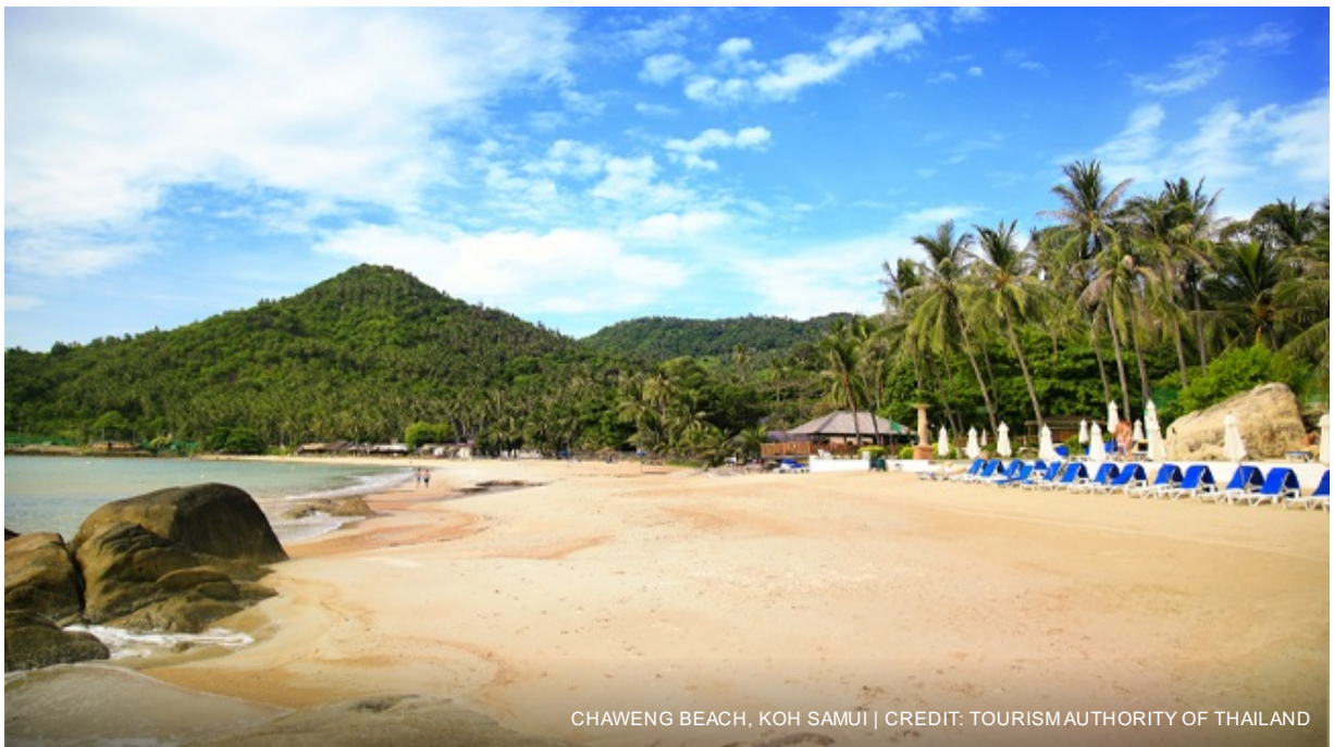
CHAWENG BEACH, KOH SAMUI