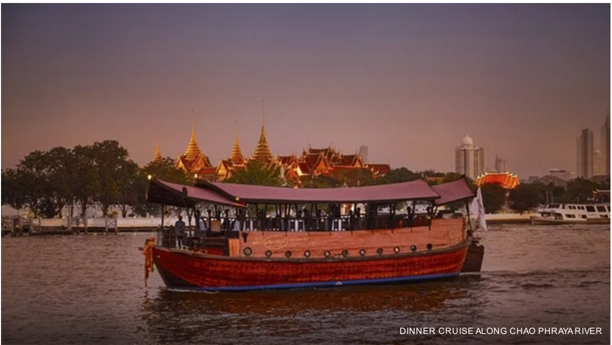
DINNER CRUISE ALONG CHAO PHRAYA RIVER