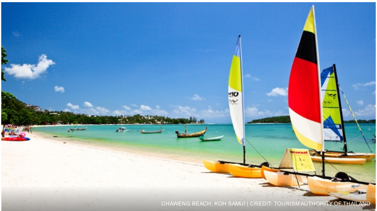
CHAWENG BEACH, KOH SAMUI | CREDIT: TOURISMAUTHORITY OF THAILAND