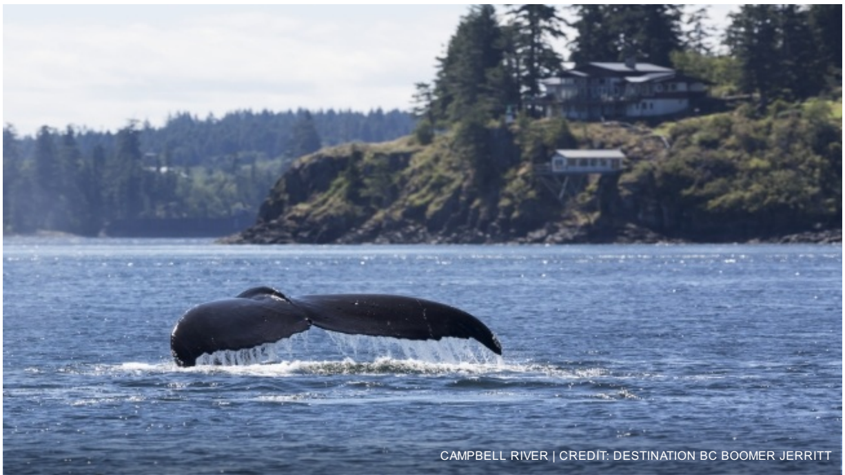
CAMPBELL RIVER