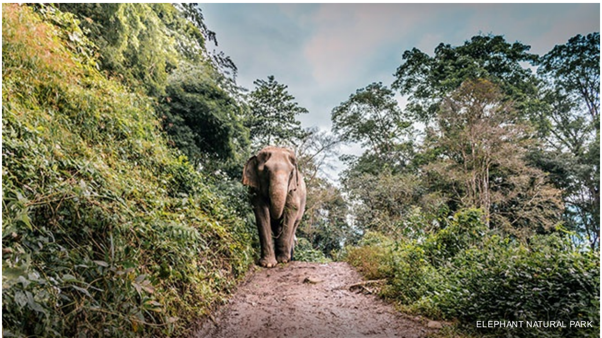
ELEPHANT NATURAL PARK