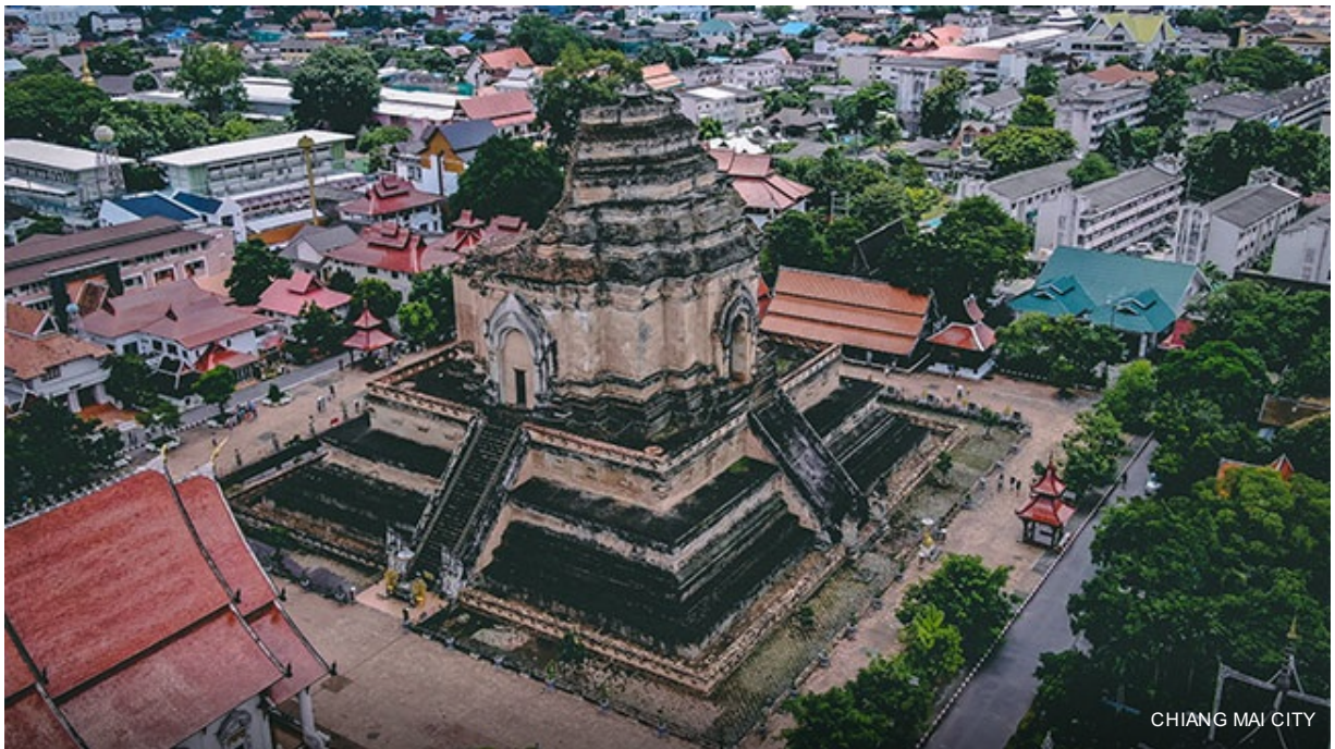
CHIANG MAI CITY