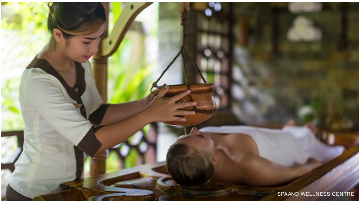
SPA AND WELLNESS CENTRE