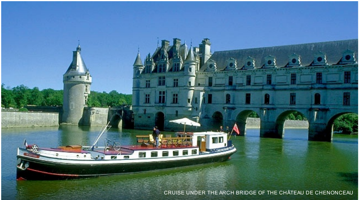
CRUISE UNDER THE ARCH BRIDGE OF THE CHÂTEAU DE CHENONCEAU