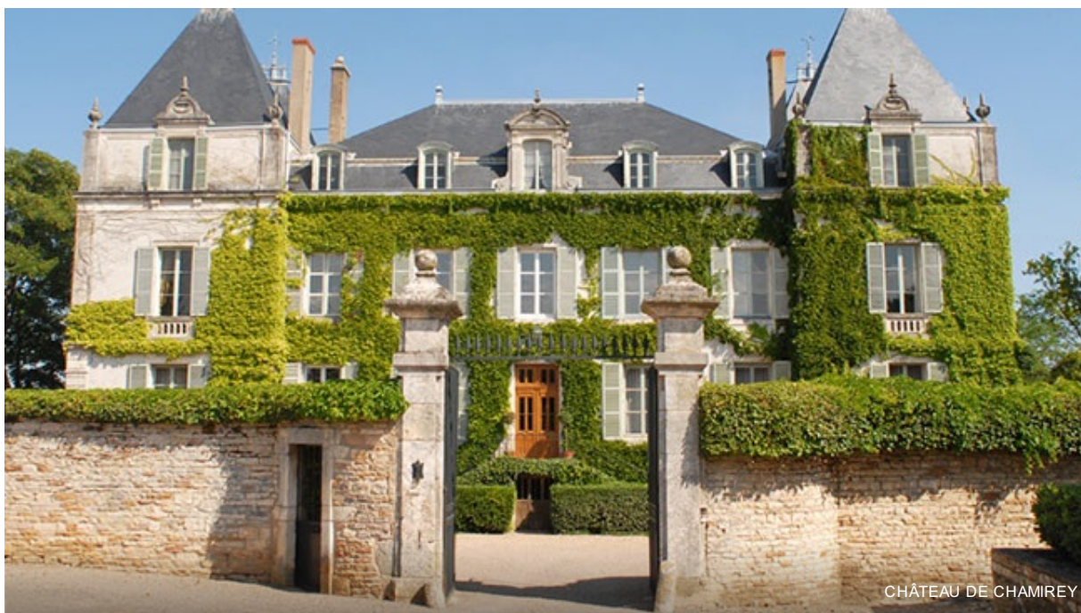
CHÂTEAU DE CHAMIREY