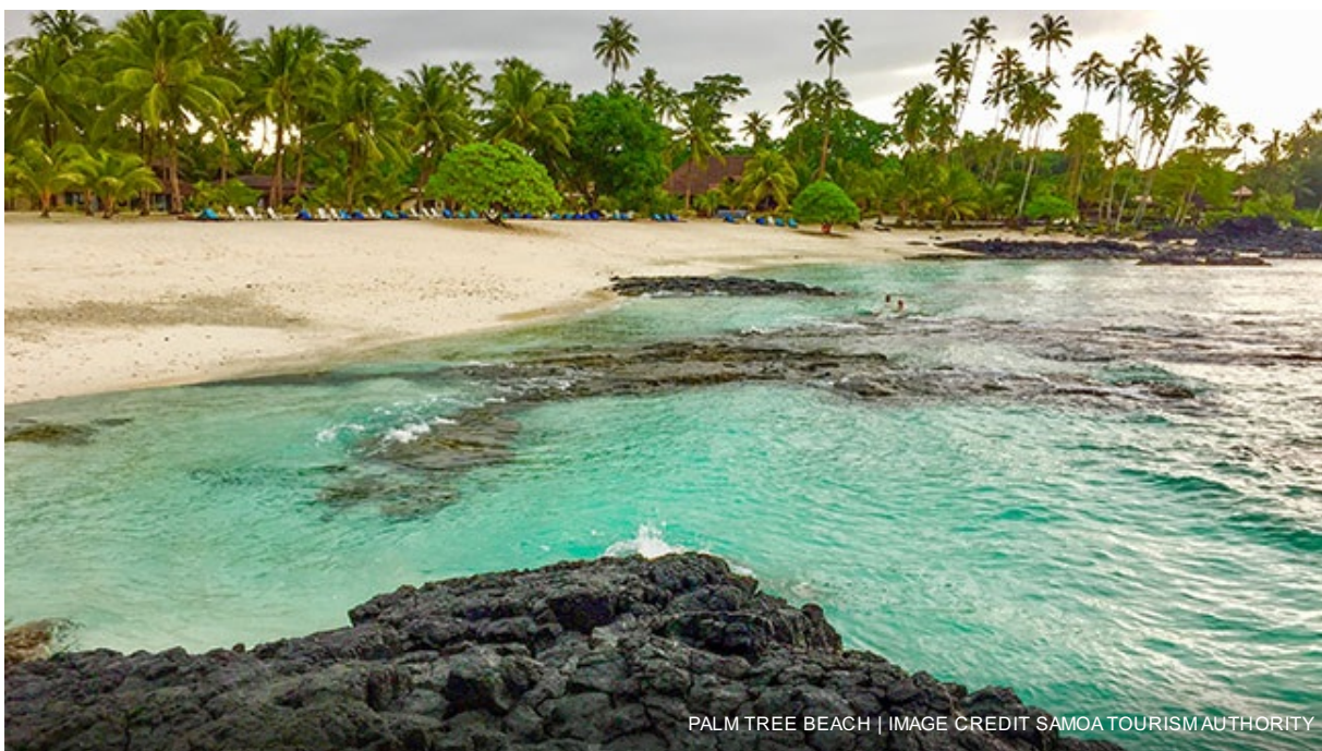
PALM TREE BEACH