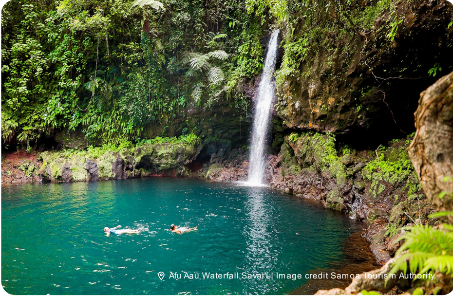
📍 Afu A'au Waterfall, Savai'i