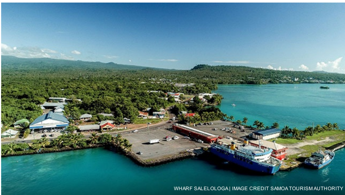
WHARF SALELOLOGA