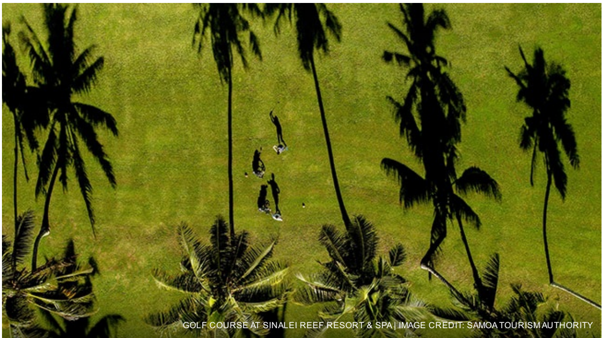
GOLF COURSE AT SINALEI REEF RESORT & SPA | IMAGE CREDIT: SAMOA TOURISM AUTHORITY

Overnight stay at Sinalei Reef Resort & Spa in a Traditional Garden Villa.