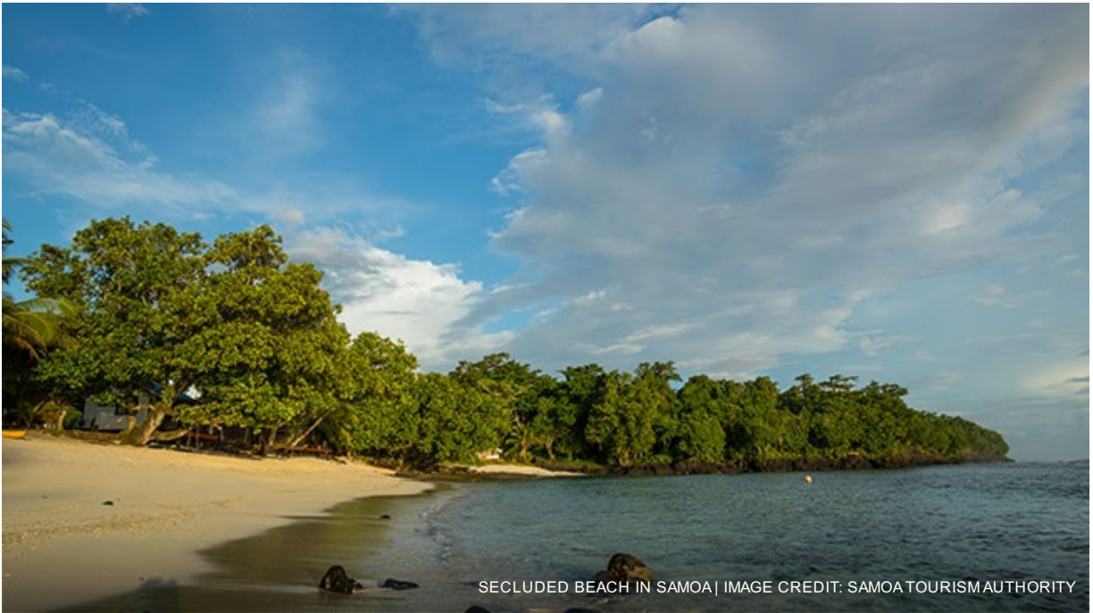
SECLUDED BEACH IN SAMOA