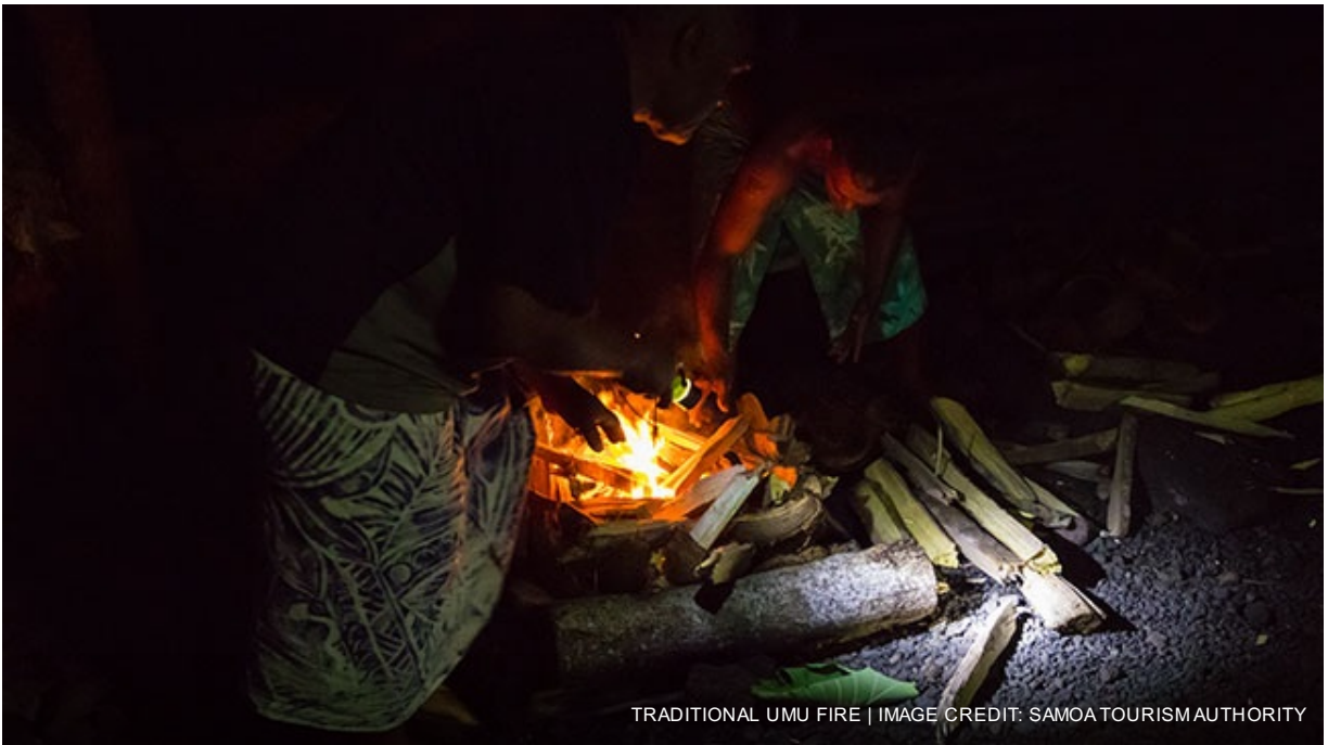
TRADITIONAL UMU FIRE