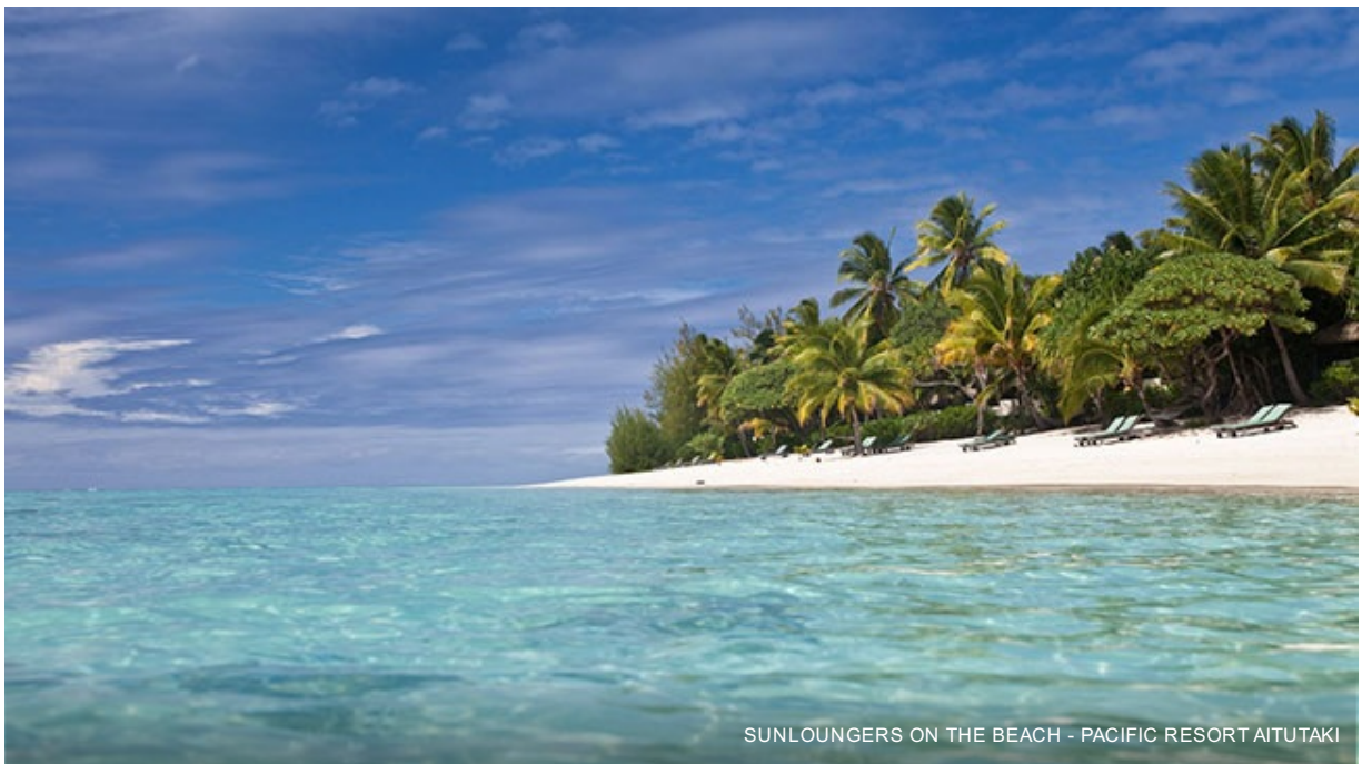
SUNLOUNGERS ON THE BEACH - PACIFIC RESORT AITUTAKI