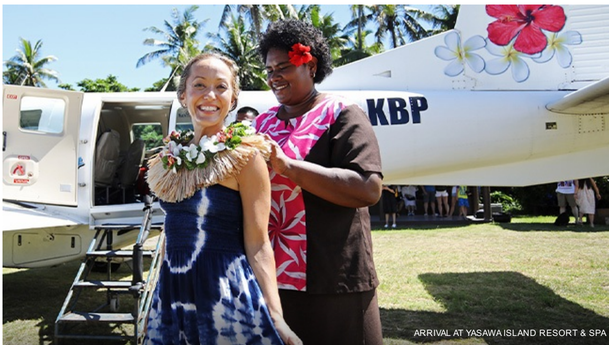
ARRIVAL AT YASAWA ISLAND RESORT & SPA