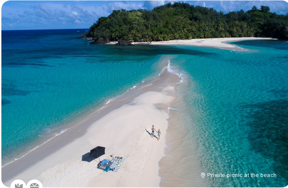
Private picnic at the beach