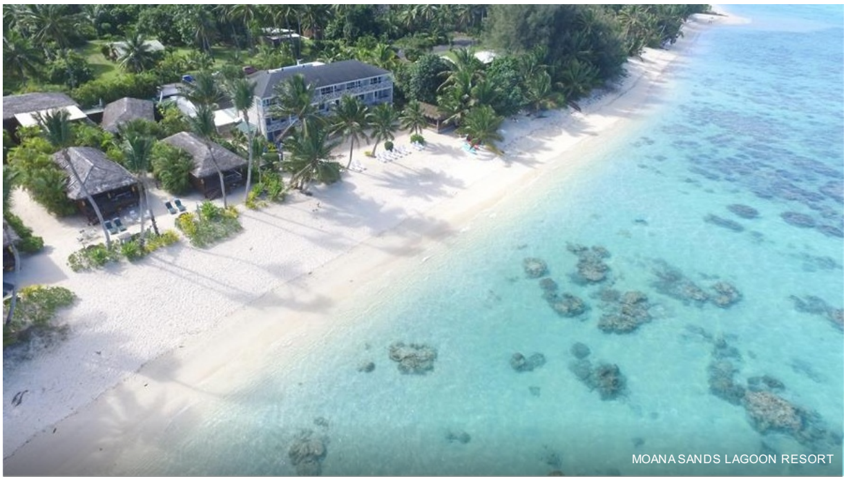
MOANA SANDS LAGOON RESORT