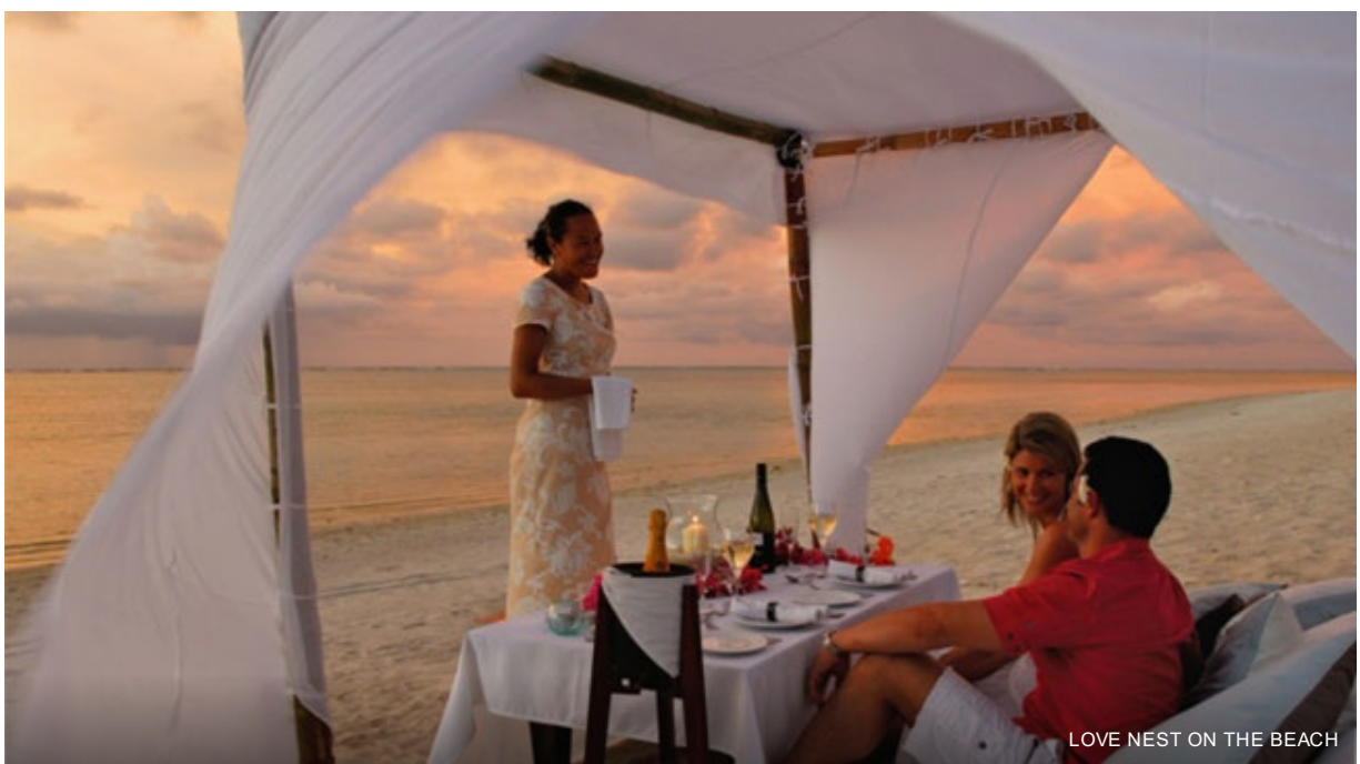
LOVE NEST ON THE BEACH