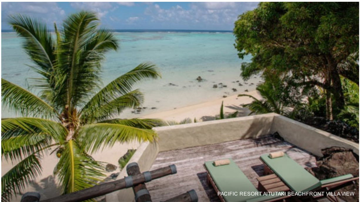
PACIFIC RESORT AITUTAKI BEACHFRONT VILLA VIEW