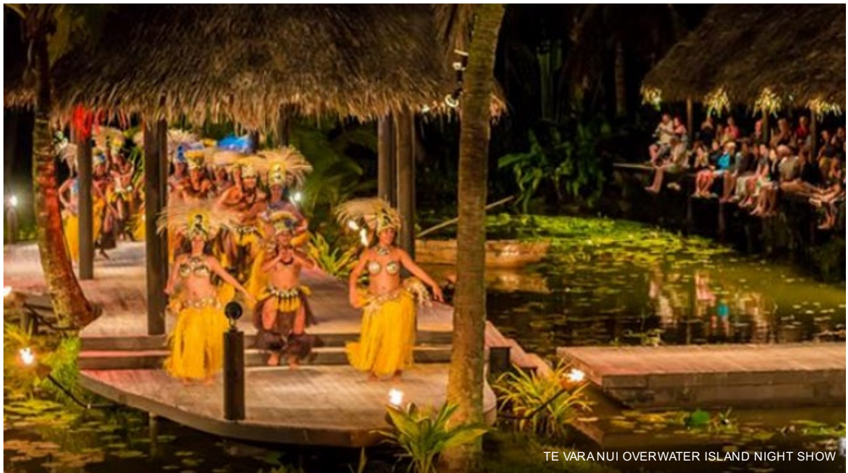
TE VARA NUI OVERWATER ISLAND NIGHT SHOW

The Cook Islands greeting Kia Orana, “may you live on” reflects the beauty not only of our islands but also of our Cook Islands people. At Te Vara Nui Village you will meet local Cook Island Maori people who will share their stories, knowledge and heritage with you during the Cultural Village Tour. Finish with Rarotonga’s finest dancers and musicians as they perform by flaming torchlight on the floating and fixed stages of our waterfall garden while enjoying our delicious buffet. This stunning Over Water Night Show reflects the experience of our Village delivering an electric and authentic cultural performance like no other on the island.