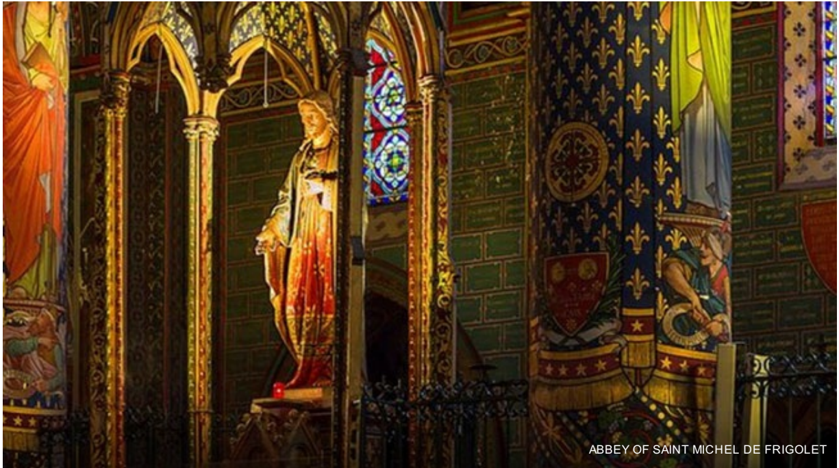
ABBEEY OF SAINT MICHEL DE FRIGOLET