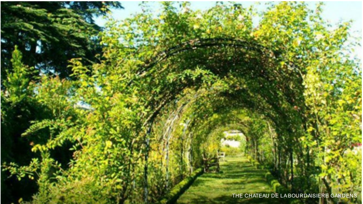
THE CHATEAU DE LABOURDAISIERE GARDENS