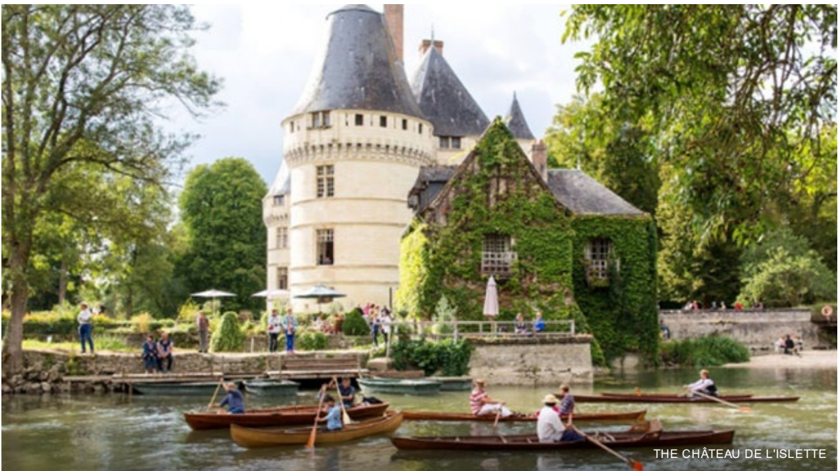
THE CHATEAU DE L'ISLETTE