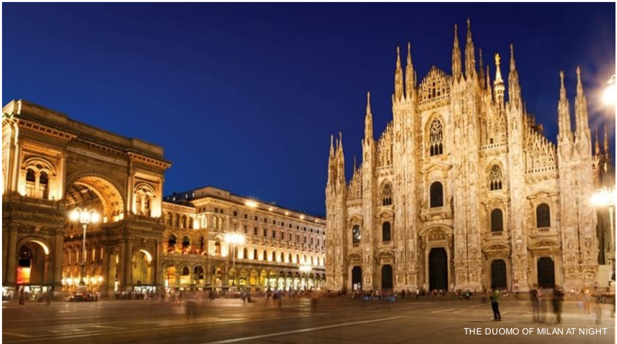
THE DUOMO OF MILAN AT NIGHT

Overnight in Milan at the Starhotels Ritz or similar.