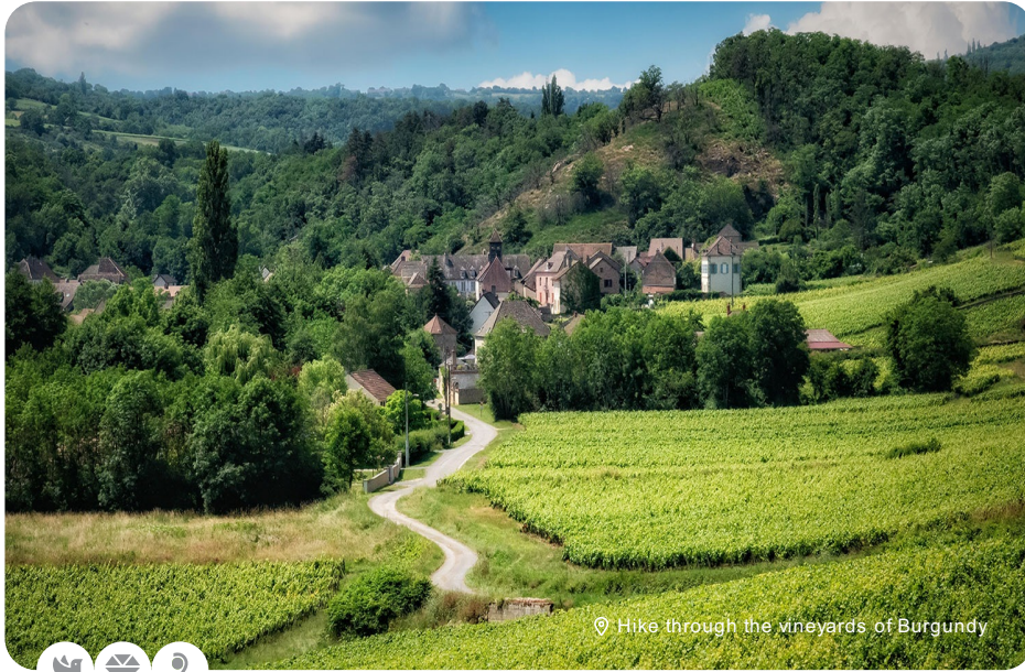
Hike through the vineyards of Burgundy