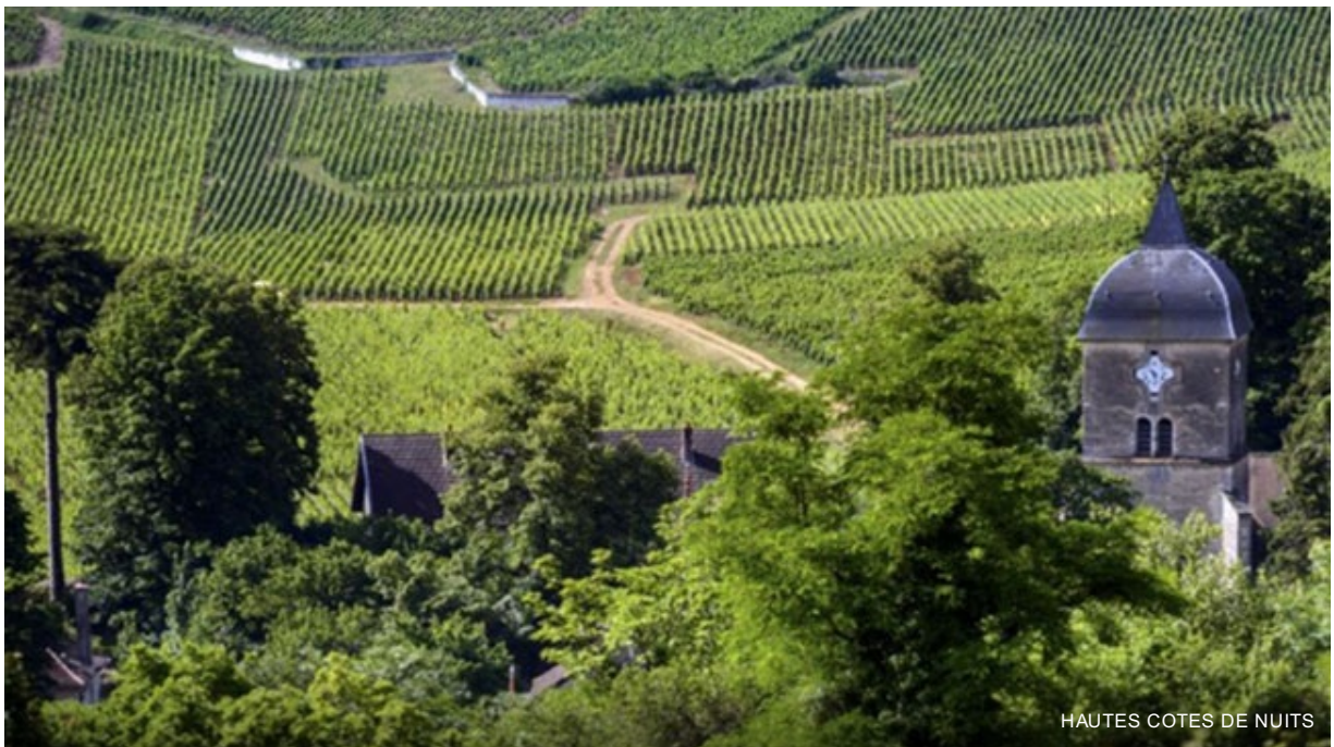
HAUTES COTES DE NUITS