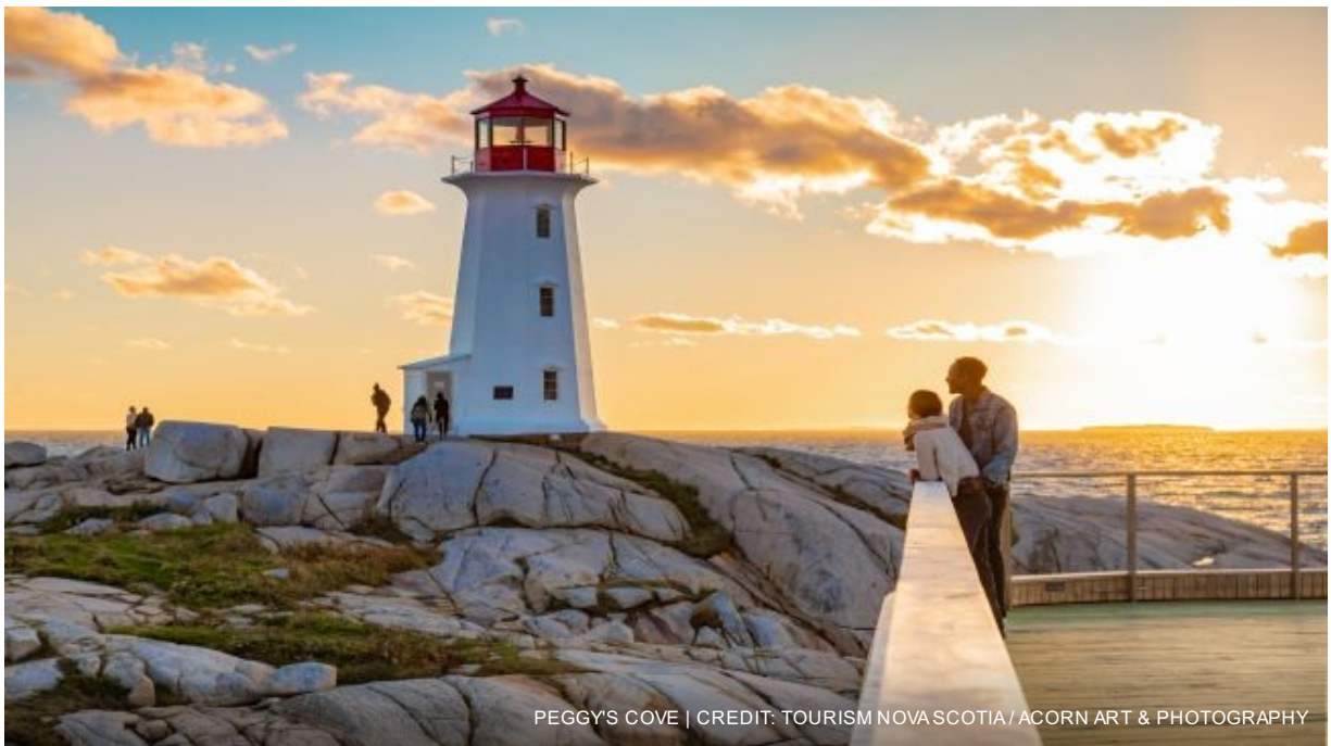
PEGGY'S COVE