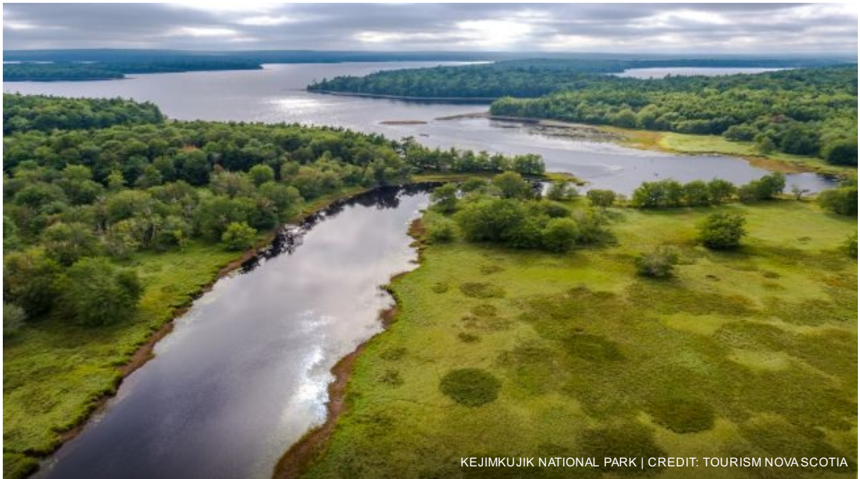
KEJIMKUJIK NATIONAL PARK