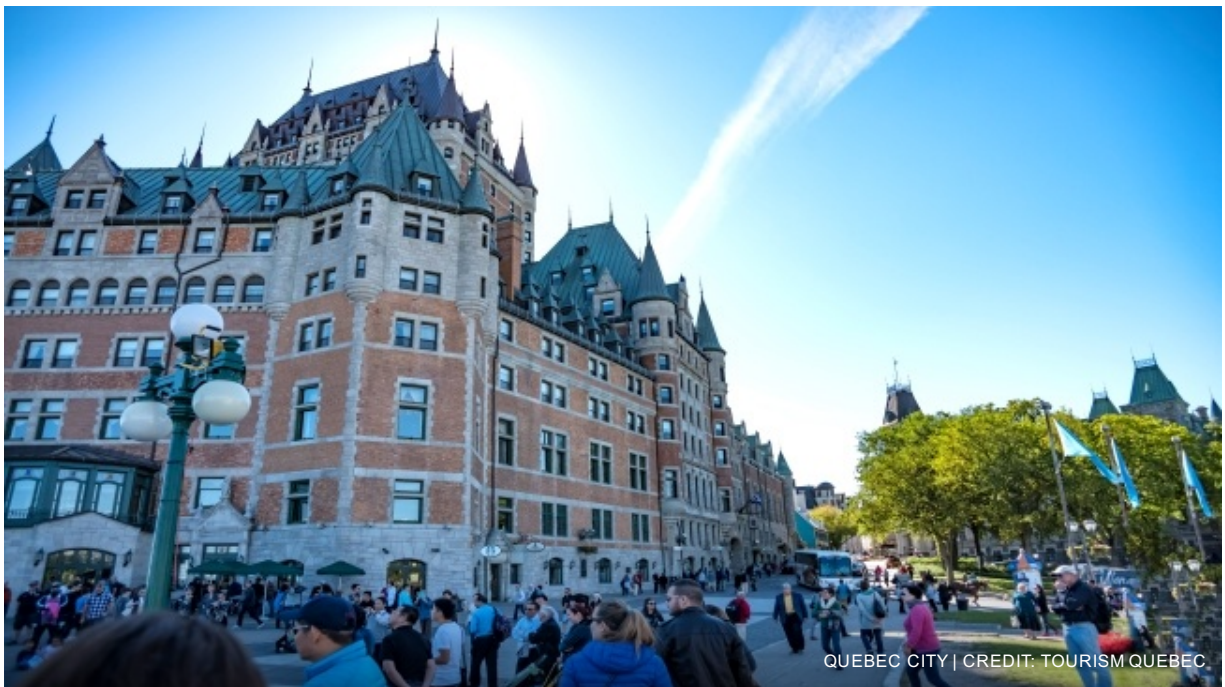
QUEBEC CITY

Overnight in Quebec City at the Hotel Chateau Laurier Quebec