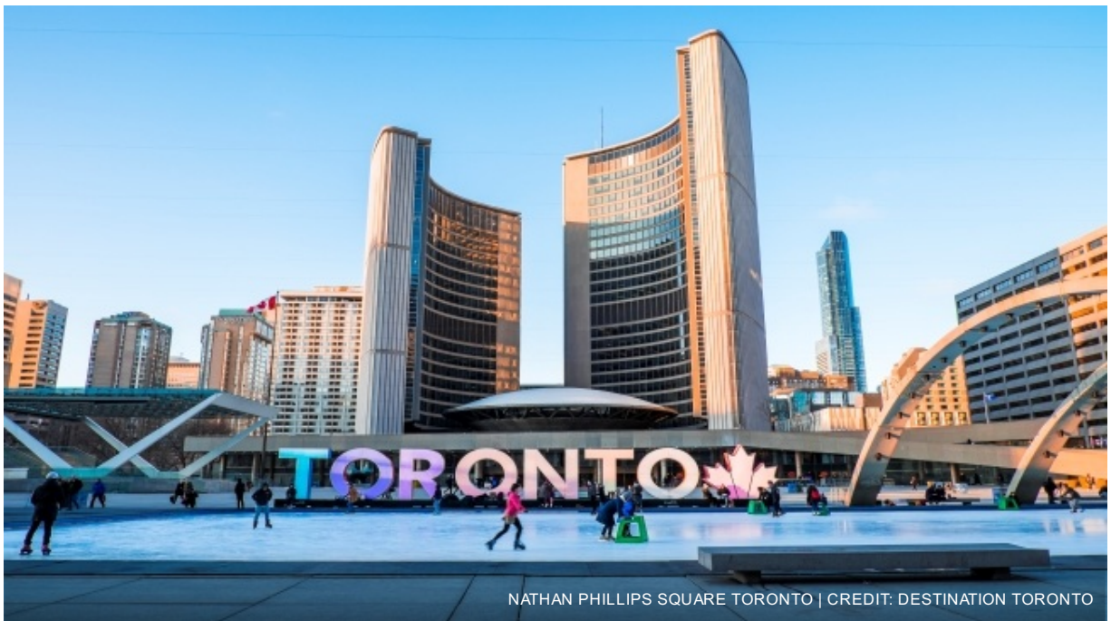
NATHAN PHILLIPS SQUARE TORONTO

Overnight in Toronto at the Sheraton Centre Hotel (or similar).