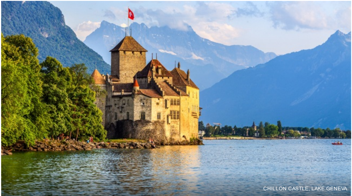
CHILLON CASTLE, LAKE GENEVA

We recommend visiting Chillon Castle in the morning, taking the lake steamer to Vevey and continuing by train to Chexbres in the late afternoon for the wine tasting.