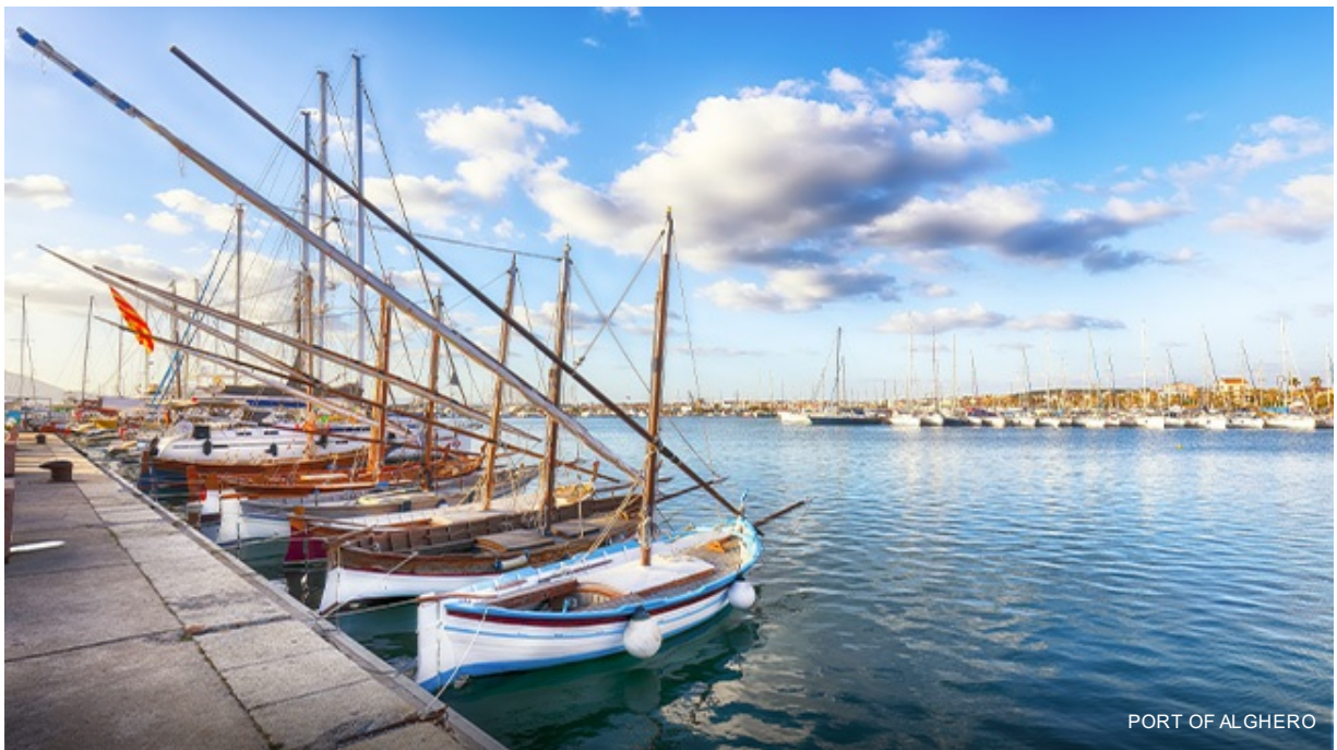
PORT OF ALGHERO