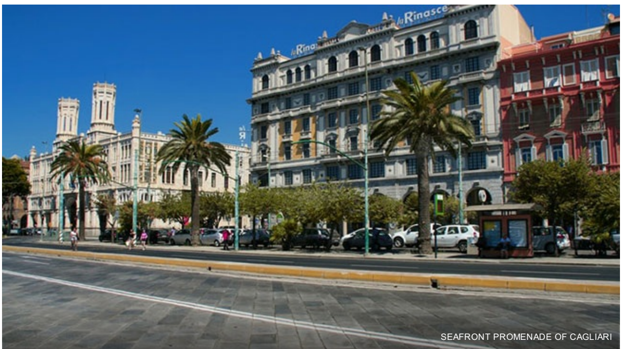
SEAFRONT PROMENADE OF CAGLIARI