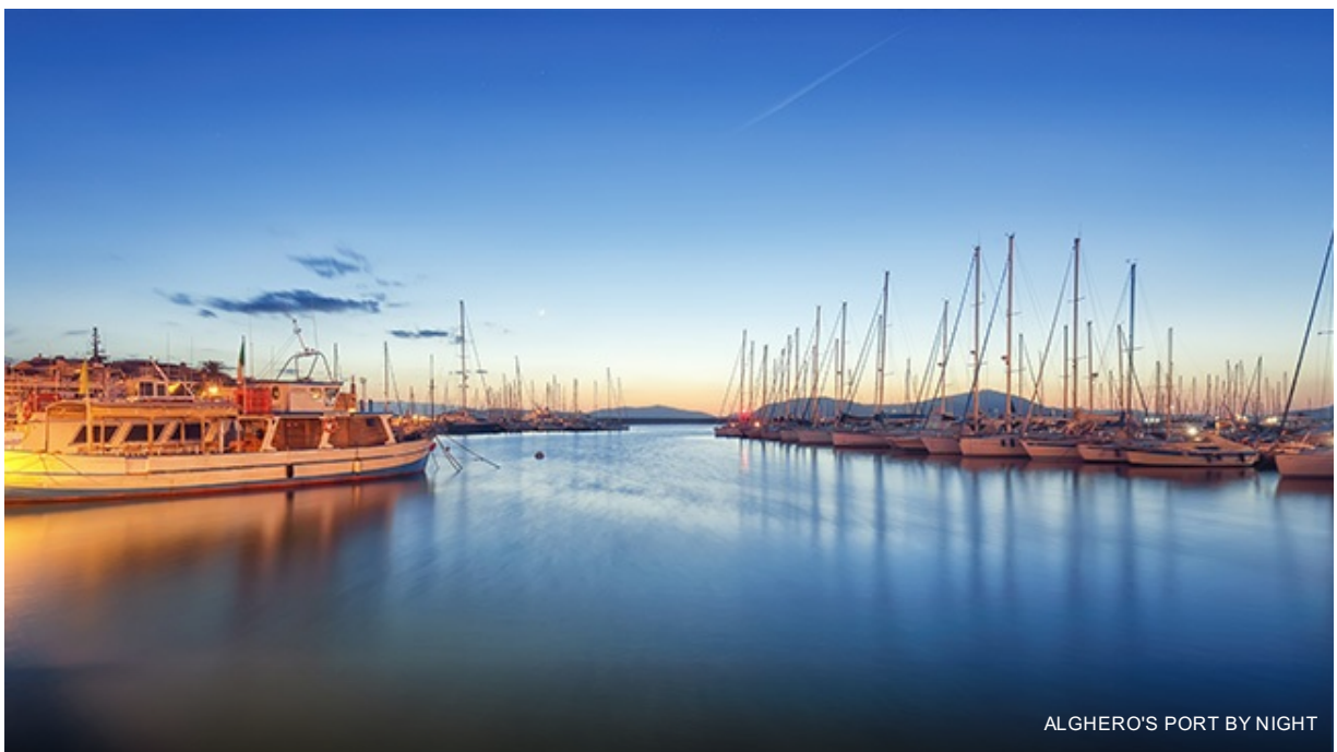
ALGHERO'S PORT BY NIGHT