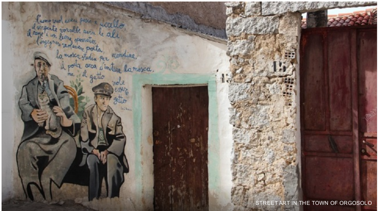
STREET ART IN THE TOWN OF ORGOSOLO