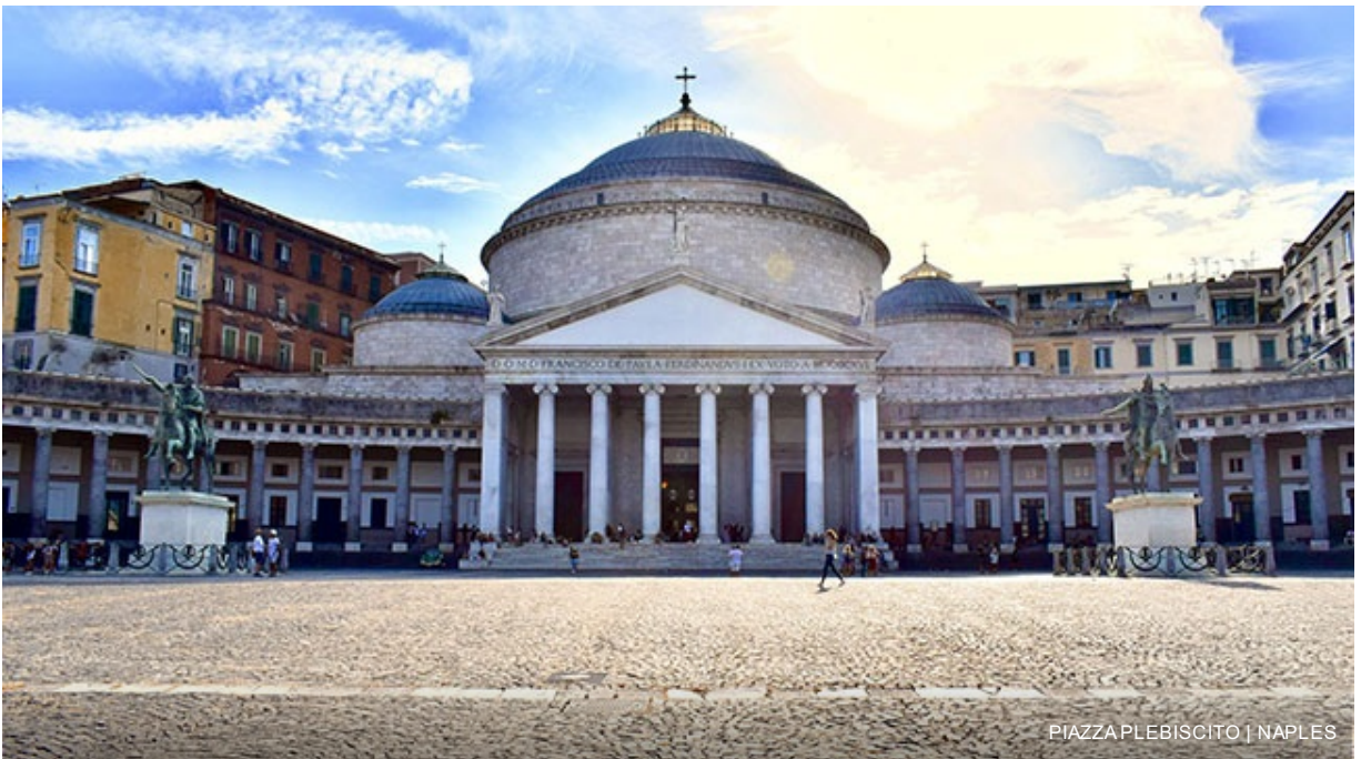
PIAZZA PLEBISCITO | NAPLES