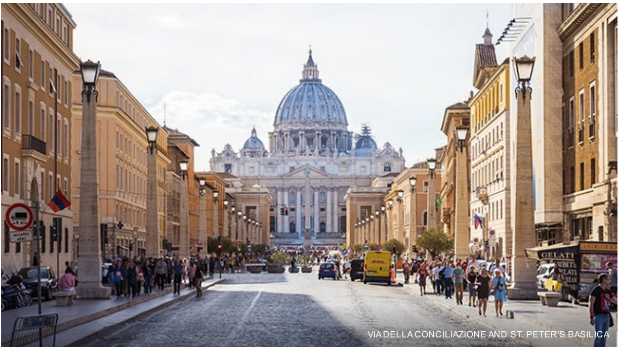
VIA DELLA CONCILIAZIONE AND ST. PETER'S BASILICA