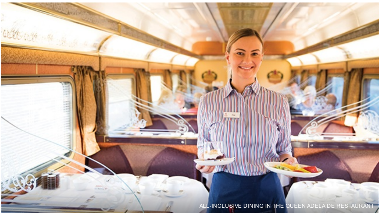
ALL-INCLUSIVE DINING IN THE QUEEN ADELAIDE RESTAURANT