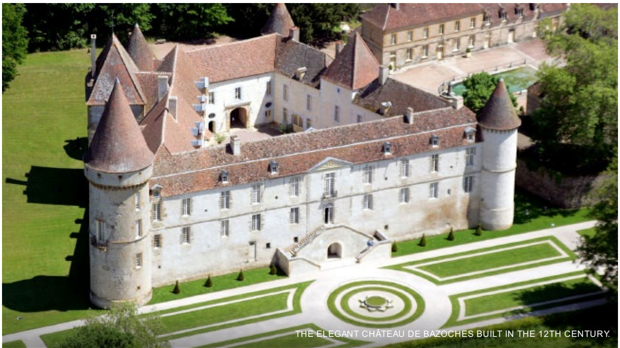
THE ELEGANT CHÂTEAU DE BAZOCHES BUILT IN THE 12TH CENTURY.