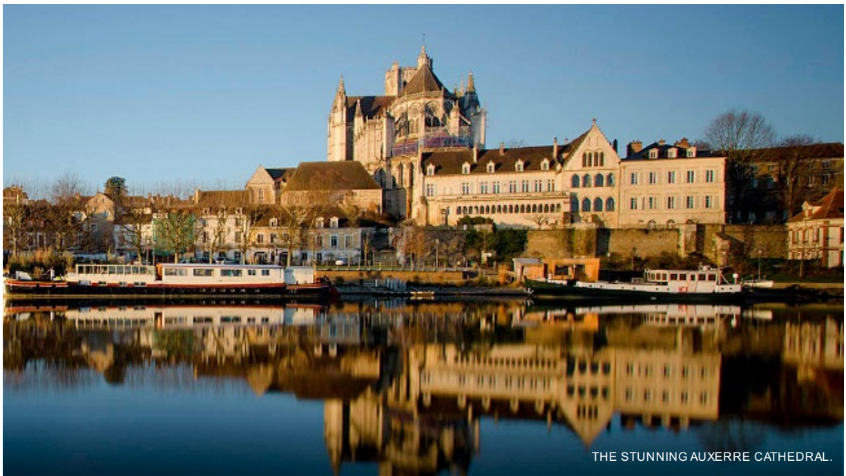
THE STUNNING AUXERRE CATHEDRAL.