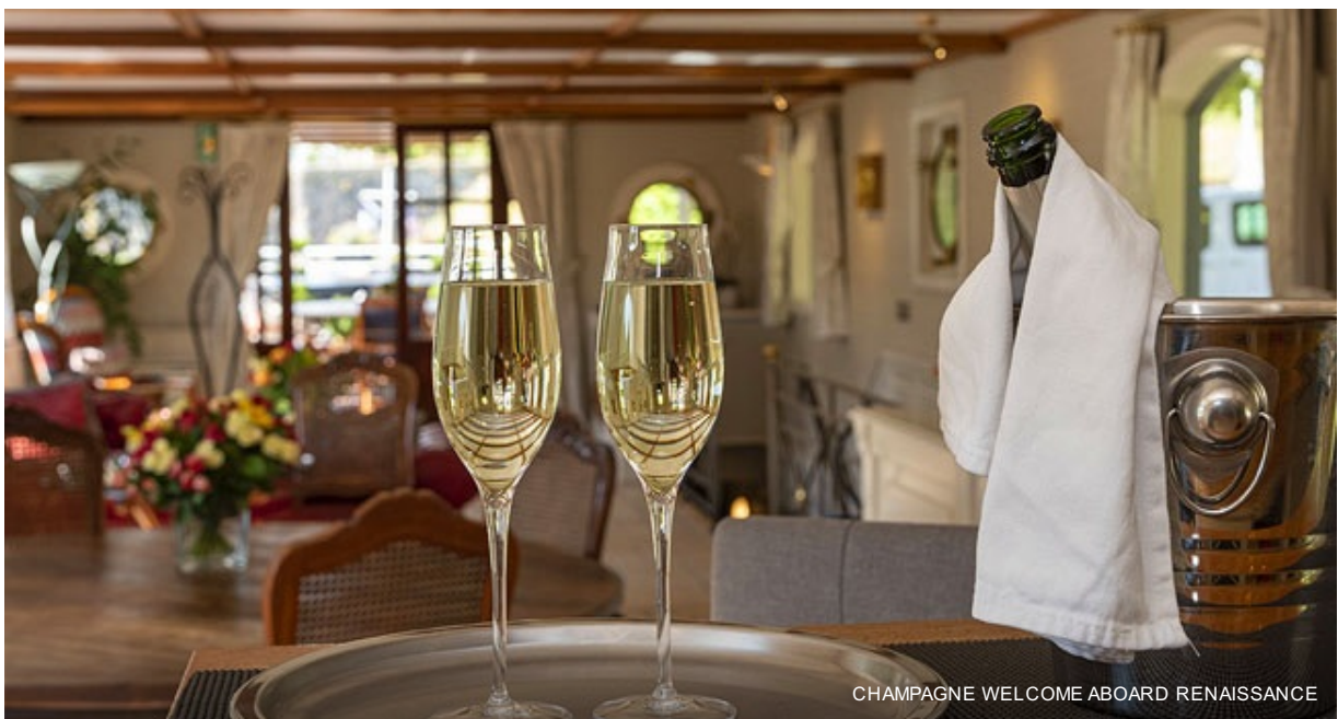
CHAMPAGNE WELCOME ABOARD RENAISSANCE