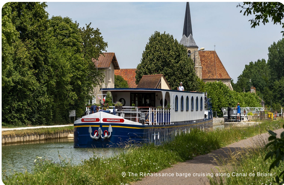
The Renaissance barge cruising along Canal de Briare