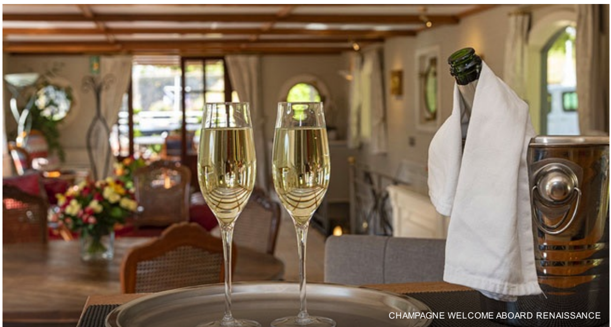
CHAMPAGNE WELCOME ABOARD RENAISSANCE