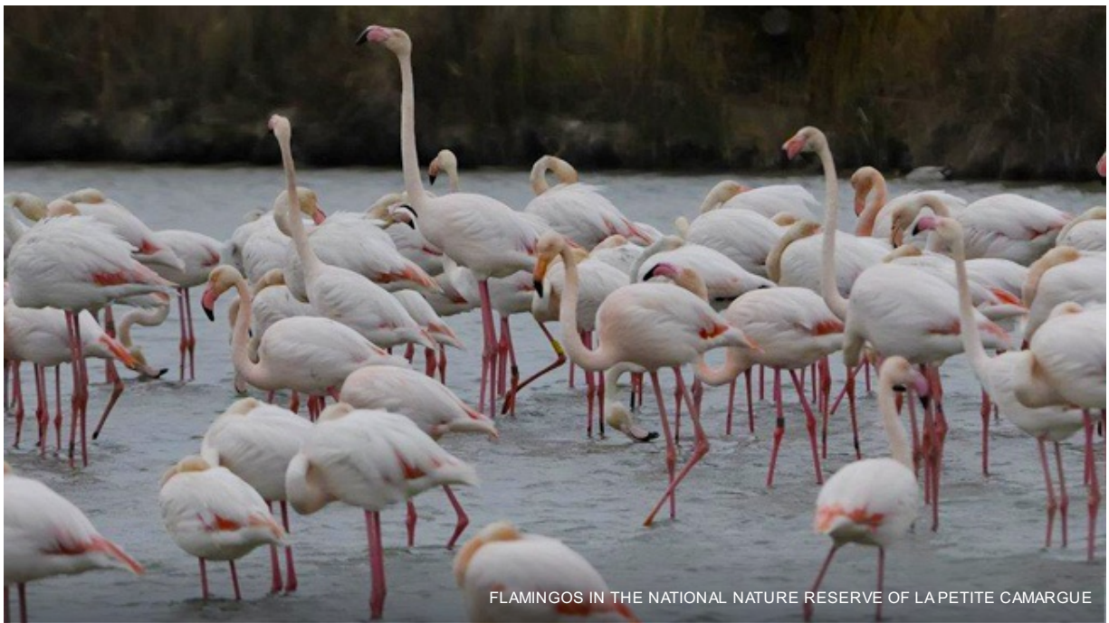
FLAMINGOS IN THE NATIONAL NATURE RESERVE OF LA PETITE CAMARGUE