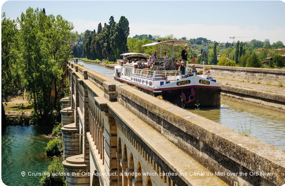
📍 Cruising across the Orb Aqueduct, a bridge which carries the Canal du Midi over the Orb River